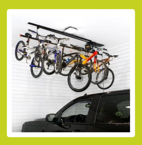
4 bike wall mount-

Keep yourself from tripping over your bikes